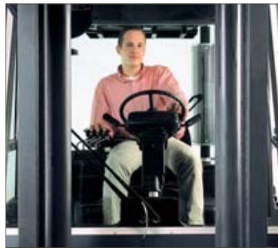
Excellent visibility through the mast