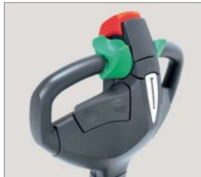
Ergonomic tiller head