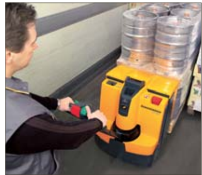
The EJE in hard everyday application