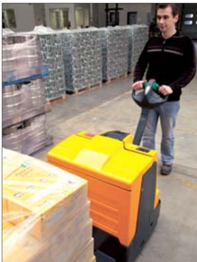
Collision protection on EJE 225 battery compartment