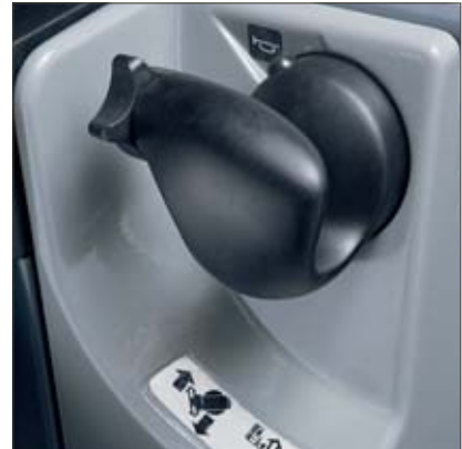
Operating module: travel and hydraulics