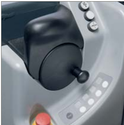
Operating module: steering

During lowering, energy is fed back into the battery – “regenerative lowering”. The energy is also fed back into the battery during braking – “regenerative braking”. The energy reclaimed in this way is available for subsequent energy consumption. The advantages: